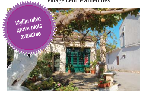
Traditional coffee shop in Kefalas Square

This picturesque village is on top of a hill, with views from one side over Chania and Souda Bay - and from the other to Georgioupolis Bay and Rethymnon. A large sloping olive grove would give all the houses uninterrupted sea views, and our plots are only 5 minutes walk from the village centre amenities.