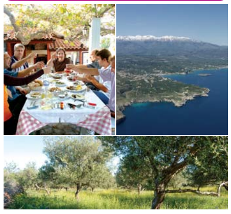
Our olive grove in Kefalas

Metaxa Brandy - Rose petals are one of the ingredients used in the production of this popular drink.