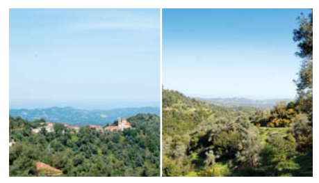
The village of Karanou

At the foot of the Omalos Mountain, Karanou is one of the most historical villages in Crete. Yet it also has all modern amenities, including minimarkets, restaurants and coffee shops. Our large plots are a very short drive from the village centre. They are on different levels and offer spectacular uninterrupted valley and sea views.